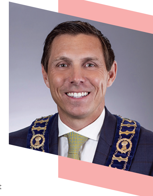
PATRICK BROWN Mayor, City of Brampton

Come out to experience Brampton's diverse culinary offerings. We promise there is a delicious food adventure for every palate!