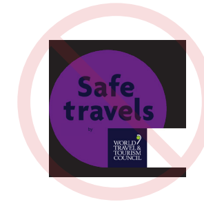
Don't change the colour of the stamp