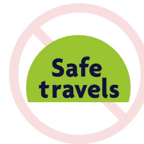
Don't use derivatives or adaptations of the stamp